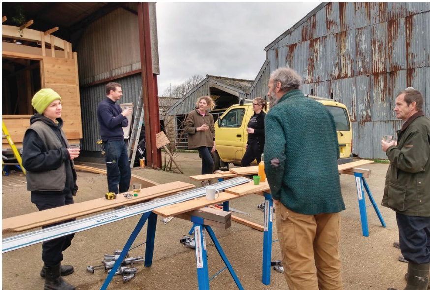
Figure 21.4. Codesign workshop participants in Denhay Farm, Bridport.

facilitate designers, practitioners, researchers, and non-design professionals' capacity to address present-day issues through collaborative and democratic means (Figure 21.4). Collaboration contributes to a mode of research and design activity that seeks to produce work capable of the sum of its parts, and in doing so, blurring of traditional divisions between user and designer creating a democratic space for dialogue and decision-making that values all opinions, ideas, and lived experiences equally (Matthews et al., 2022; Sanders and Stappers, 2008). In bringing together the creativity and situated knowledge of those with relevant lived experience and expertise into the design process, participatory work can provide insight otherwise unavailable (Matthews et al., 2022).