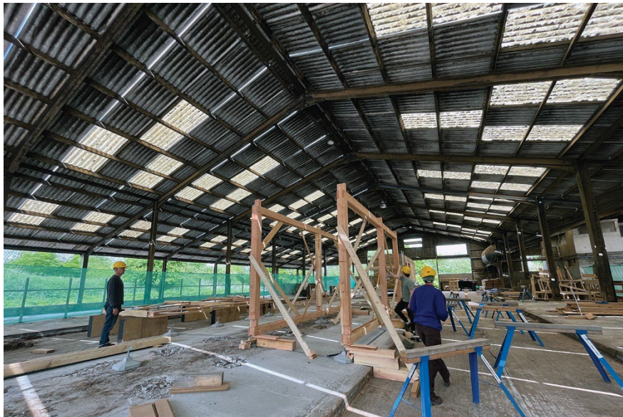
Figure 21.3. Timber structure for housing design and experimentation with building elements at Denhay Farm, Bridport.

setting where local stakeholders can meet, test, and demonstrate building elements and discuss local development issues around housing construction, the fitness and scope for automation technologies ‘in place’, and material languages and provenance that are directly connected to their local landscape—both physically and socially (Figure 21.3). Digitally cut ash timber, hand mixed hemp/clay insulation material, and timber assemblies became prototypes of building elements and at the same time probes (Sanders and Stappers, 2014) allowing us to get a glimpse into local community organisations, local supply chain dynamics, local economies, and the influence (or lack thereof) of national policies and investment plans. Here, we counter traditional ‘professionalised’ views of design practice, and expand on the repositioning of design activity within futures and place-based agendas.