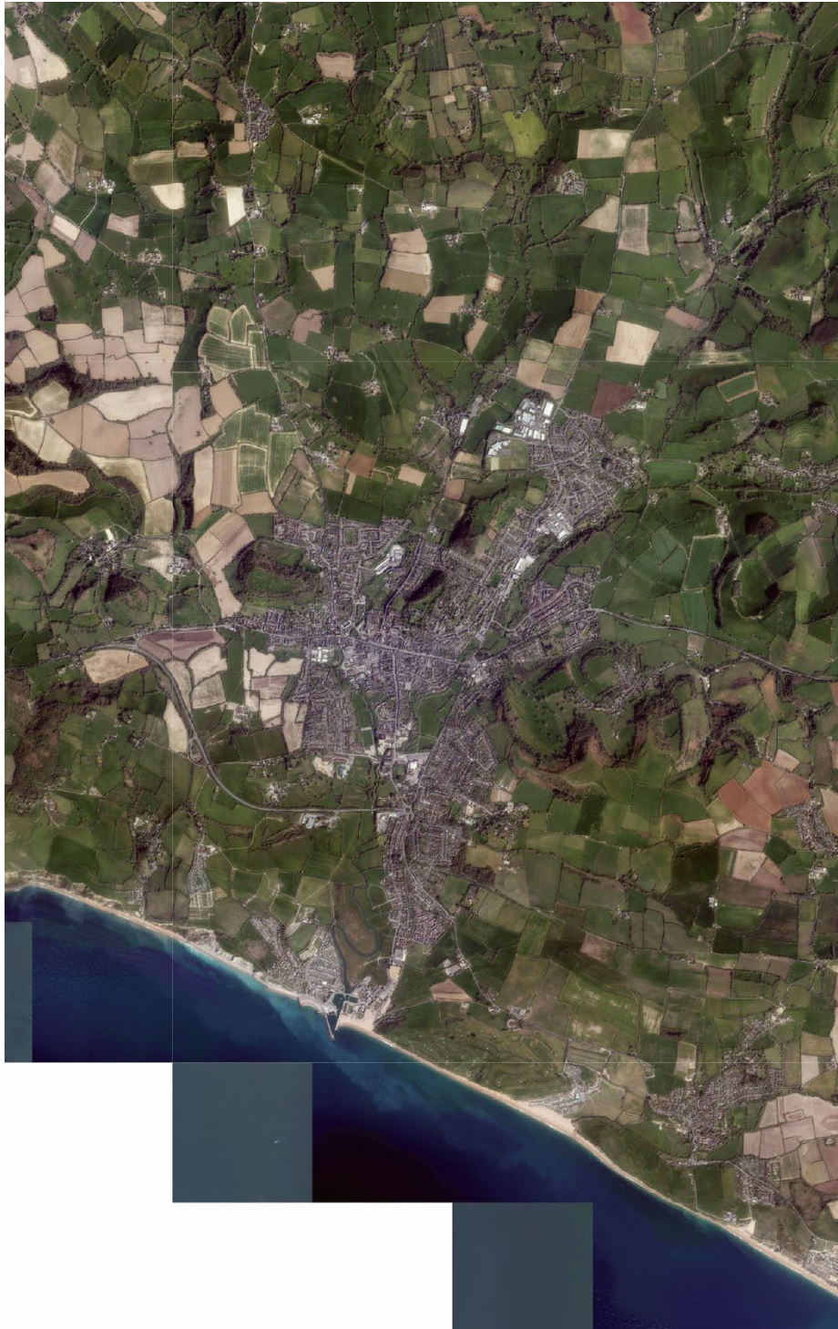
Figure 21.1. Aerial photograph of Bridport and surrounding area.

To develop these, a partnership was established with the University of Plymouth's School of Art, Design and Architecture. Through a stream of projects funded by UK Research and Innovation, we have delivered fieldwork activity comprising material studies, community workshops, interviews, and 'living lab' spaces enabling local groups of stakeholders to engage with future visions of housing in alignment with local investment plans and longer-term housing projects on existing sites (Figure