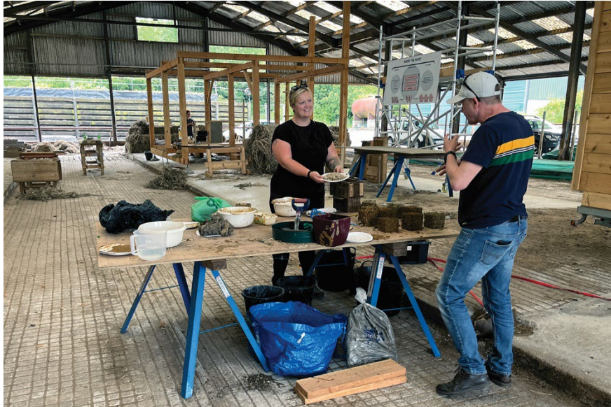
Figure 21.2. Material experimentation and showcase with hemp/clay mixes in the living lab at Denhay Farm, Bridport.

embodying socio-cultural and environmental conditions that can facilitate (or neglect) collectiveness—shifting our focus from what the design is , to what design actually does (Yaneva and Heaphy, 2012).